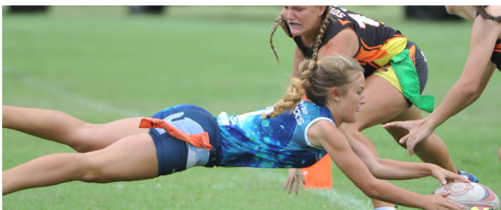
Queensland Oztag Tri Series, Sunshine Coast Stadium