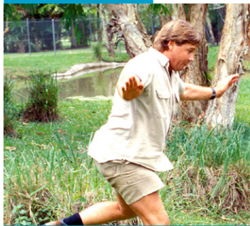
Steve Irwin Day, Australia Zoo

Kawana Triathlon, Kawana Sports Precinct