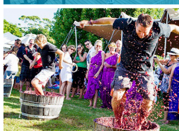
Grape Stomp, Flame Hill Vineyard