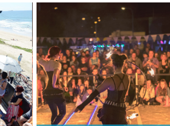
Horizon Festival of Arts and Culture