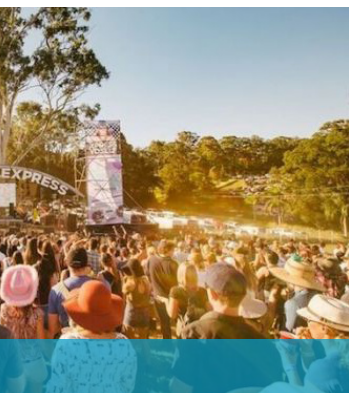
Sunshine Coast Agricultural Show, Nambour Showgrounds