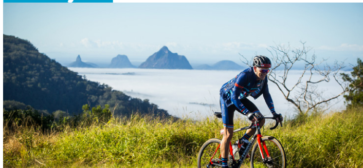
Velothon Sunshine Coast