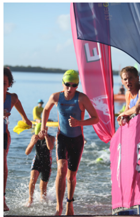
Caloundra Triathlon, Golden Beach