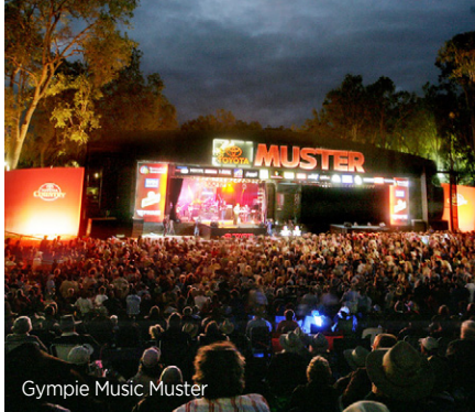
Gympie Music Muster