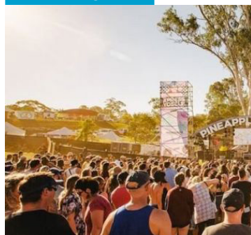
Big Pineapple Music Festival