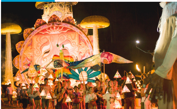
Woodford Folk Festival