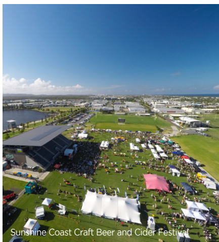
Sunshine Coast Craft Beer and Cider Festival

The Ginger Flower and Food Festival is a great opportunity to learn first-hand from experts on everything ginger; be it flowers and gardening to cooking demonstrations, they'll show you it all, while the Ignite Chilli Festival turns up the heat with chilli and spice and all things nice. Not only are these food festivals a way for the top producers in the region to bring the very best produce to your plate, it's a great way to interact directly with the food you're tasting.