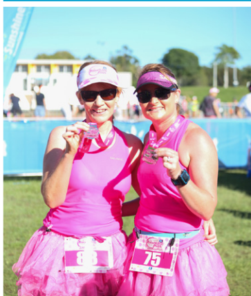
Triathlon Pink, University of the Sunshine Coast

Sunshine Coast Ukelele Festival, Kenilworth