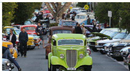
Downunder Beachfest, Caloundra