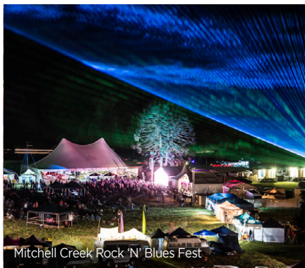
Mitchell Creek Rock 'N' Blues Fest

From cruisy coastlines to hinterland wonders, the renowned Gympie Music Muster and Mitchell Creek Rock 'N' Blues Fest will make your toes tap, while the Sunshine Coast Ukelele Festival will keep you smiling. The Woodford Folk Festival transports you to another world, where you can immerse your senses in the vibrant atmosphere. Set over the New Year period, this unique folk festival puts on an incomparable colourful celebration, with unique street art, hand-crafted installations, a choice of international performances from circus shows to comedies and a standout line-up of world class musicians.