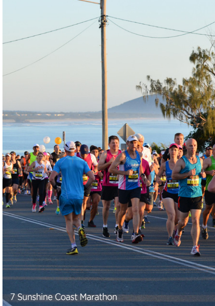
7 Sunshine Coast Marathon

The Sunshine Coast is a favourite location for triathlon and multi sport events. Mooloolaba is home to IRONMAN 70.3 and the Mooloolaba Triathlon, while other state triathlons, run by the Queensland Triathlon Series, enjoy competing in Caloundra and Kawana, which offer picturesque conditions for competitors.