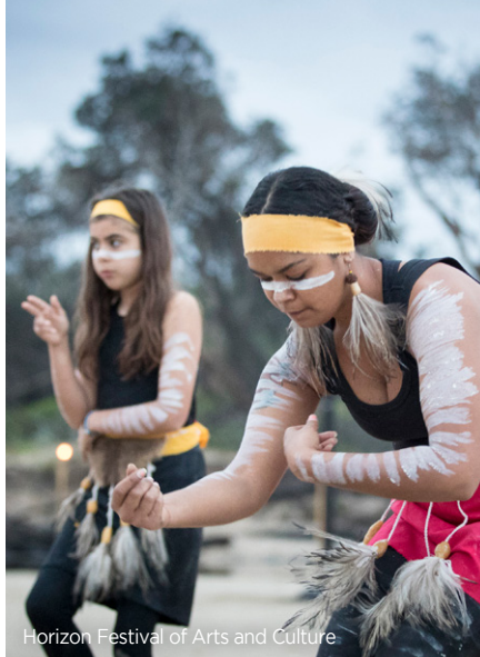
Horizon Festival of Arts and Culture