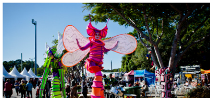
Queensland Garden Expo, Nambour Showgrounds