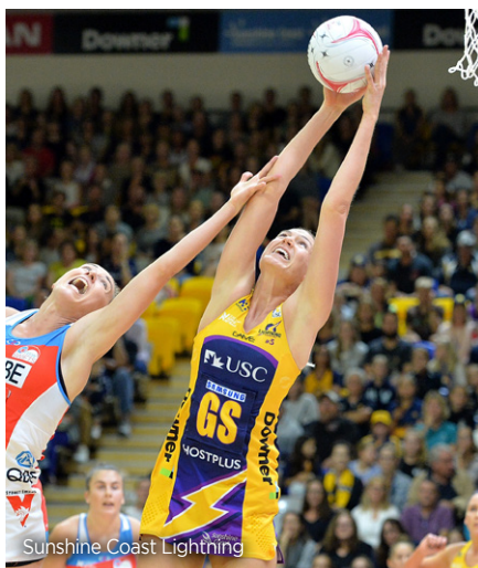
Sunshine Coast Lightning

The 2017 Suncorp Super Netball champions love to live and play on the Sunshine Coast, and you can watch them wear their colours proudly at any of the seven home games that will played at USC Stadium during the April to August 2018 season.