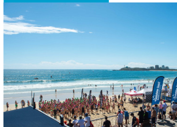
Mooloolaba Beach Festival