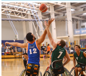
Suncoast Spinners Tournament, Caloundra

Queensland Oztag Junior State Cup, Sunshine Coast Stadium