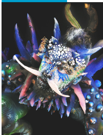
Australian Body Art Festival, Cooroy