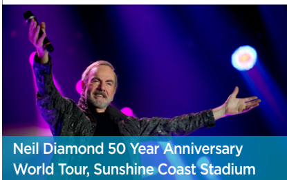
Neil Diamond 50 Year Anniversary World Tour, Sunshine Coast Stadium