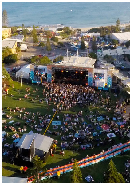
Caloundra Music Festival