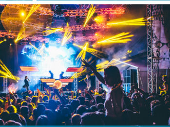
Maroochy Music & Vis Arts Festival