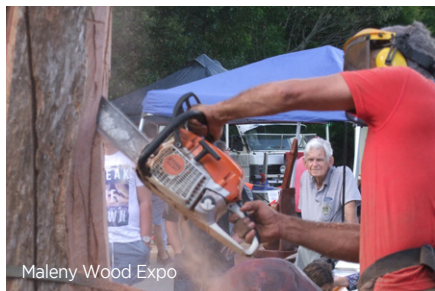
Maleny Wood Expo

Step out of your comfort zone and experience the annual creativity of the Australian Body Art Festival and the Sunshine Coast Fashion Festival, showcasing local and international designers' passions for the human form; everything is art. From the luxe to the relaxed comes YogaFest, set to unwind and rejuvenate from the inside out. With stunning natural wonders to escape to, the Sunshine Coast is the perfect balance between the hive of art events and connecting with the natural world.