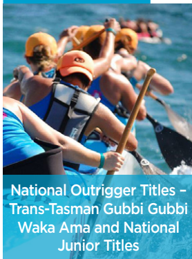
National Outrigger Titles – Trans-Tasman Gubbi Gubbi Waka Ama and National Junior Titles