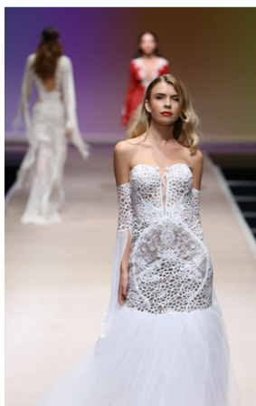
Sunshine Coast Fashion Festival, Caloundra