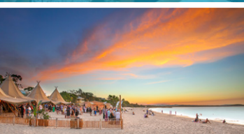
Noosa Food and Wine