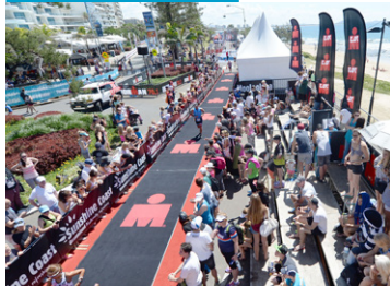
IRONMAN 70.3 Sunshine Coast