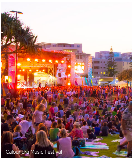
Caloundra Music Festival

The Big Pineapple Music Festival opens its arms to music lovers from across the country for a magical day of good tunes, rays, a laid-back vibe and infectious energy. Not to be outdone, the Maroochy Music and Visual Arts Festival tails the year with a music festival like no other. Coinciding with the Horizon Festival of Arts and Culture, this music festival intertwines the best of creative industries with a world-class visual arts program. Music festivals on the Sunshine Coast are a plethora of atmosphere and good vibes.